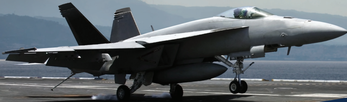
F/A-18 with ACLS Radar Beacon Landing on Aircraft Carrier